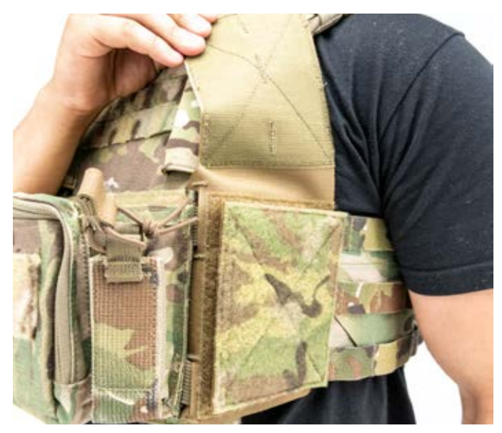
11.Pull forward on the Cummerbund ends and attach the fronts of the Cummerbund to the hook and loop loop field of the Side Entry Panels.