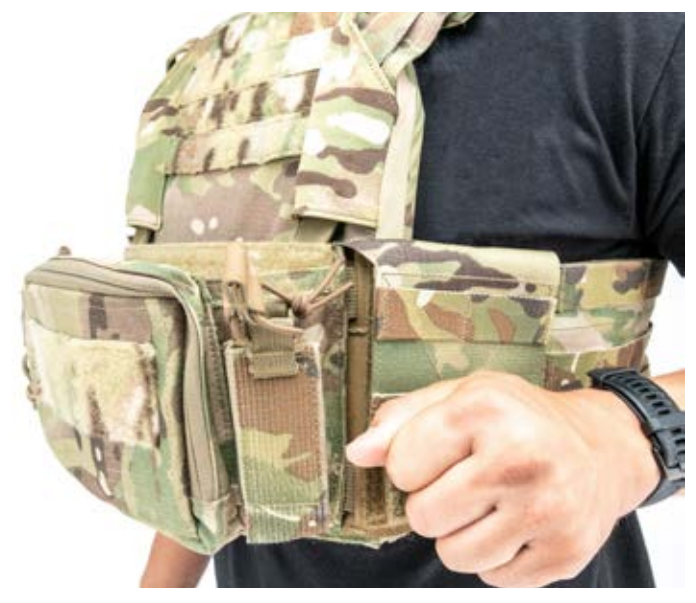
12.Secure the front flaps of the Side Entry Panel via hook and loop.