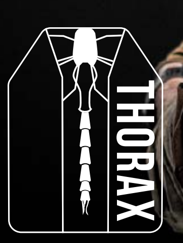
PLATE BAGS & ARMOR